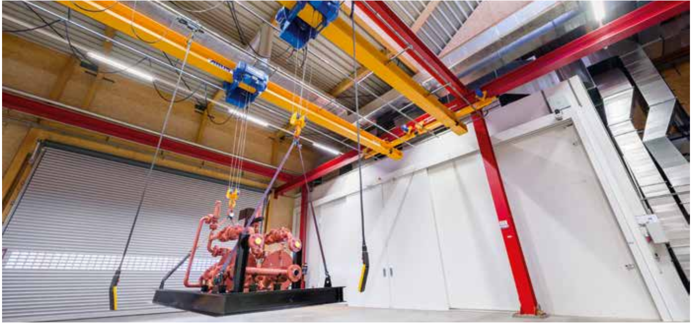
There are sufficient cranes for handling the modules.

Building Options. Competence, room and facilities for module building.