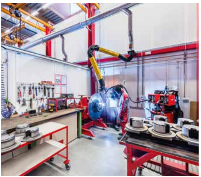
One of five modern welding booths.