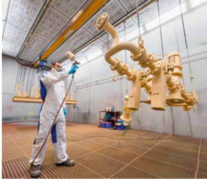
One of two paint shops.